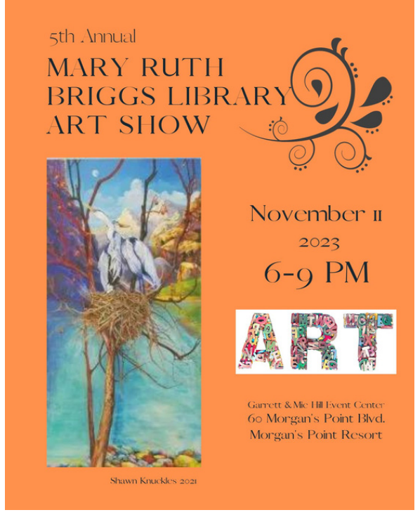
Consider sponsoring the annual art show. It's so popular, your advertising will sure to bring in a few new customers!